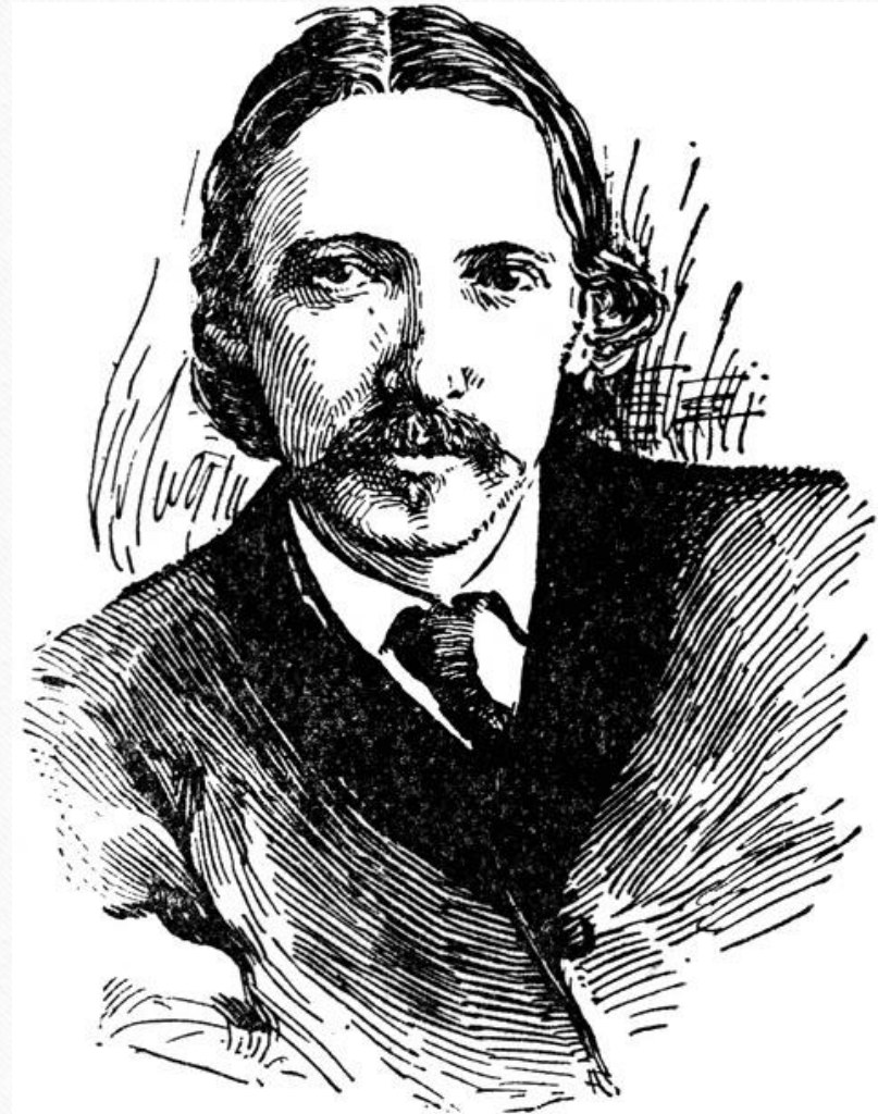
Robert Louis Stevenson